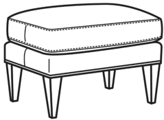
Anderson / L1955-07 Leather Ottoman (23W X 17D) Outside: 23W x 17D x 17.5H Inside: 0W x 0D