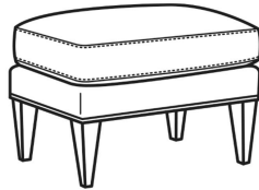
Anderson / 1955-07 Ottoman (23W X 17D) Outside: 23W x 17D x 17.5H Inside: 0W x 0D